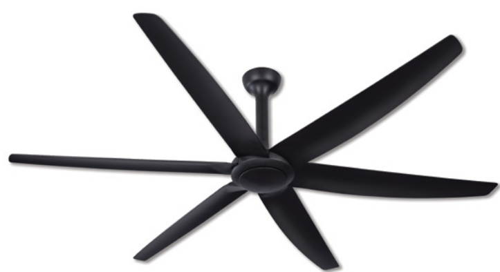
TBF1062 MATT BLACK With matt black blades 270cm (106")