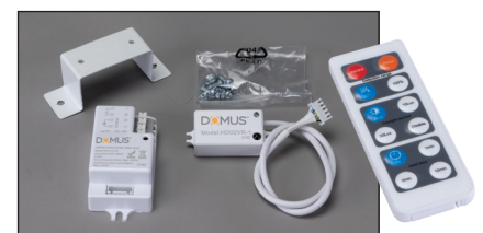
Internal ON/Off Sensor