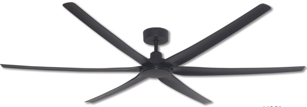
M801 MATT BLACK With matt black polymer blades 2030mm (80")