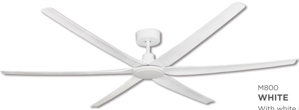
M800 WHITE With white polymer blades 2030mm (80")