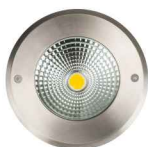
SCREW DOWN FACE