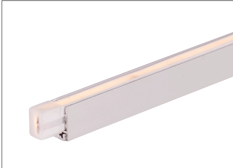
Shown with Aluminium Channel