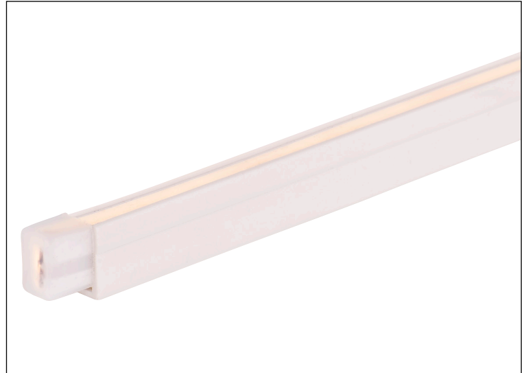
Shown with PVC Channel