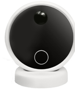
HV9252 Switch + Sensor