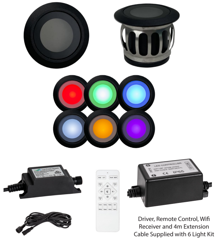
Driver, Remote Control, Wifi Receiver and 4m Extension Cable Supplied with 6 Light Kit