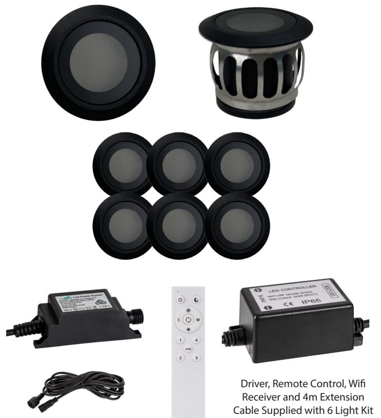
Driver, Remote Control, Wifi Receiver and 4m Extension Cable Supplied with 6 Light Kit