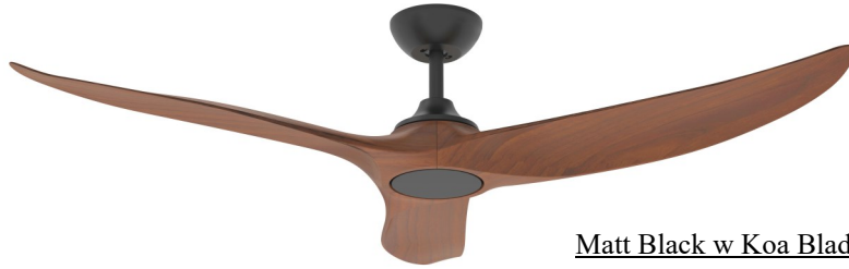
Matt Black w Koa Blades