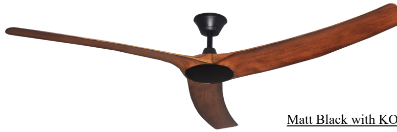
Matt Black with KOA Blades