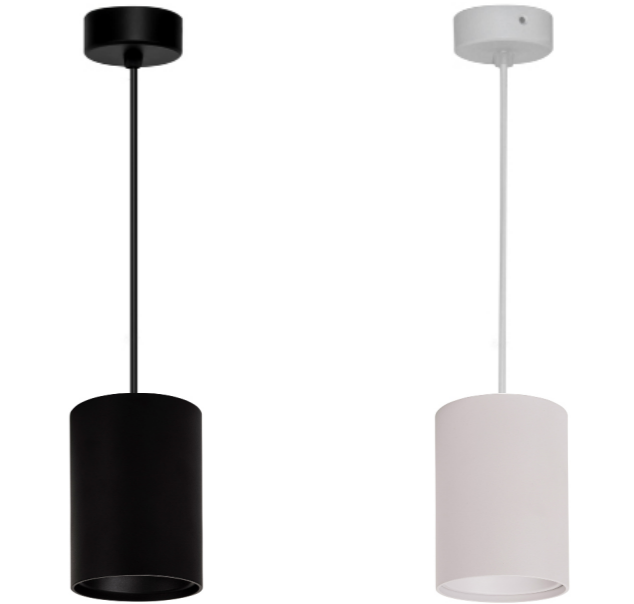
HCP-89018-BLK-PDT 3M PENDANT ACCESSORY