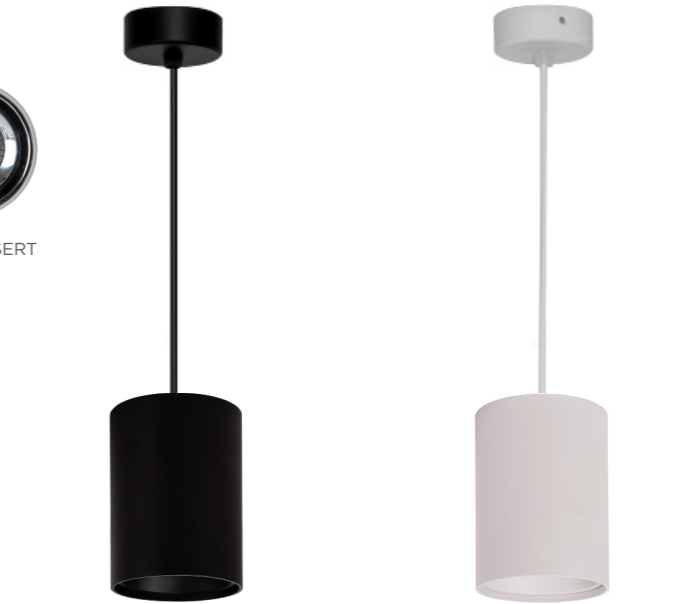
HCP-89012-BLK-PDT 3M PENDANT ACCESSORY