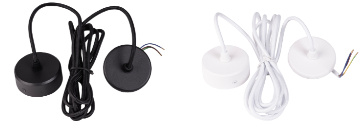
HCP-89012-WHT-PDT 3M PENDANT ACCESSORY