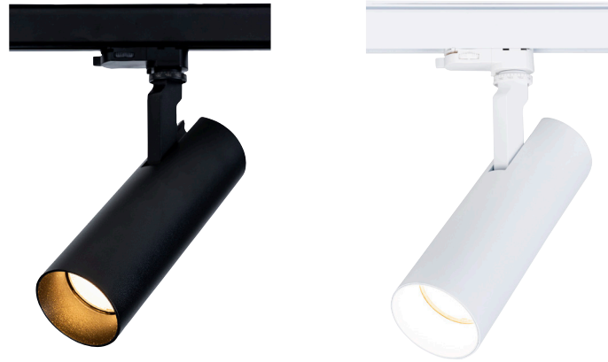
Black Three Circuit Track

HCP-102310 1M | HCP-102320 2M | HCP-102330 3M