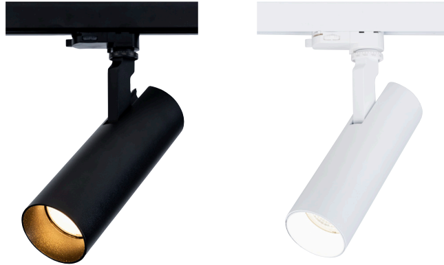
Black Three Circuit Track

HCP-102310 1M | HCP-102320 2M | HCP-102330 3M