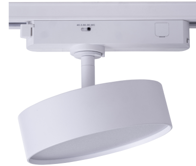
Black Single Circuit Track