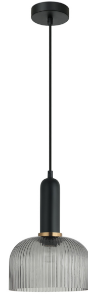
VINTAJ13 (Smokey Black Glass)