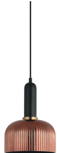
VINTAJ16 (Copper Painted Glass)