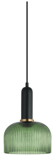
VINTAJ14 (Green Glass)