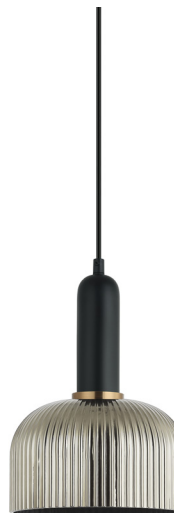
VINTAJ17 (Chrome Glass)