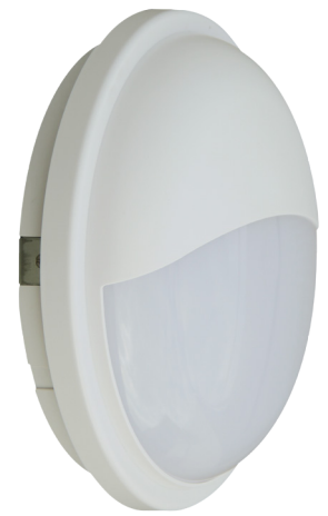
BULK16 & 18