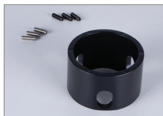
Use this adapter for a 60mm post